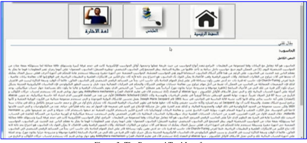
Figure 3: The Proposed Tool Interface