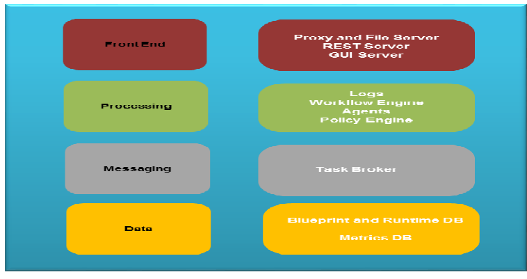
Figure 4. Cloudify Stack

Cloudify Manager deploys and manages applications described in blueprints. The manager's main responsibilities are to run automation processes described in workflow scripts and issue execution commands to the agents. Cloudify is controlled via a REST API. The REST API covers all the cloud orchestration and management functions. Cloudify's Web GUI works with the REST API to add additional value and visibility. Cloudify uses a Workflow engine to allow automation process through built-in and custom workflows. Workflow engine is responsible of timing and orchestrating tasks for creating or manipulating the application components. The user can write custom workflows in Python using API's that provide access to the topology components.