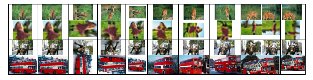
Figure 1. Structure images; column 1: input query image; columns 2 - 11: retrieved output images

To validate the proposed system, based on statistical non-parametric tests, the concepts discussed in sections 2.1 and 2.2 are implemented with the image database constructed as discussed above. Due to space constraints, for sample, some of the images considered for the experiment are presented in Figures 1 and 2. The experiment is conducted at various levels of significance for the input query image given in column 1 of Figure 1. The images in columns 2, 3, 4, 5 of Figure 1 are retrieved at level of significance, 0.001; images in columns 6, 7 are retrieved at 0.05 level of significance; at 0.15 level of significance, the system retrieves the images in columns 8, 9, 10 and 11.